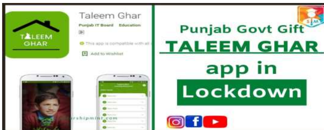
Figure.1: Pictorial view of Taleem Ghar App

The public and private schools were also closed during the Pandemic COVID-19. So, a great challenge has been faced by the Primary, Secondary and Higher secondary (K2) school's students. The Government of Pakistan has taken the steps to compensate the loss of these student by launching an application called as "Taleem Ghar". This application delivers recorded lectures of different classes including K2 in different times. It was the good initiative of Government of Pakistan. Now every student can watch the recorded lecture related to his class on this application.