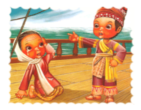
Figure 3. The Sample Image to be Analysed by the Respondents