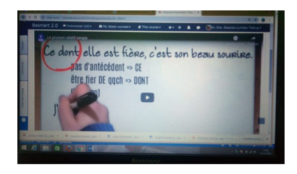
Figure 2. The Example of the Online Videos

From the result above, students indicated that the display on the web has been very good, the description presented on the web were very clear. In addition to sharing files in power point form, by using blended learning, the lecturer also shared the links of videos in YouTube. Figure 2 is the example of videos that the lecturer share.