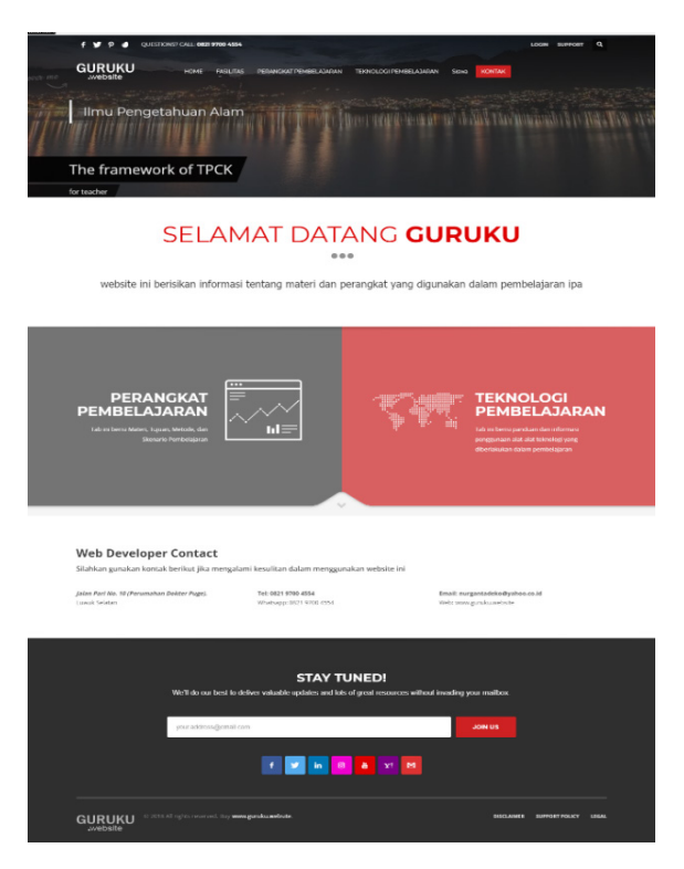
Figure 1. Homepage of the TPACK Website

The results of product validation carried out through assessments of the website media and material experts for the TPACK instruments are shown in the Tables 10 and 11, respectively. The TPACK instrument validation results show that the aspects of TK, PK, and CK of the instruments are very feasible to be used. Moreover, the website validation results show that the TPACK website is also feasible.